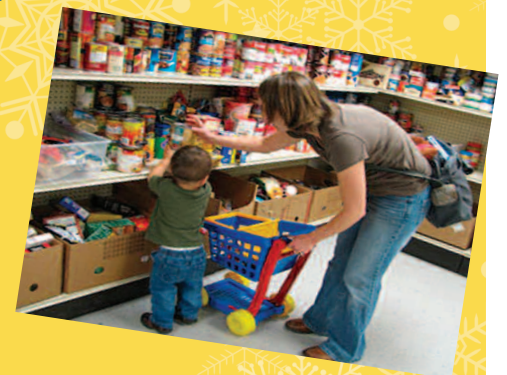
During the month of March 2013, 21,760 Nova Scotians were assisted by food banks.

We hope you will take an afternoon that you would have spent with us, and spend it enjoying your loved ones and all the joy that the season offers.