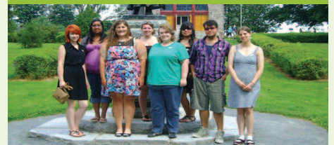
WIU students at Grand Pré Historic Park.

A group of students from Western Illinois University arrived in the Valley on July 6 to enjoy the rich cultural experience of the Wolfville area, and to visit and learn about local community development and social entrepreneurial initiatives. The students were participating in a French language immersion course at the Université de Moncton and we hosted them for the day. We visited Grand Pré National Historic Site, Just Us Coffee Roasters, the Wolfville Farmers' Market, Taproot Farms, the Kings Cultural Mapping Project, and finished the day with supper on the beach at Hall's Harbour. We've been considering offering study tours of the area and had a good time with this one, so may offer more.